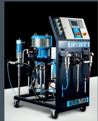
WIWA DUOMIX, pneumatic plural component spray equipment