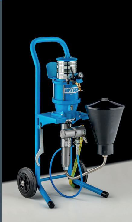
PHOENIX GX Feed hopper