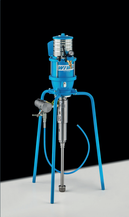
PHOENIX GX Tripod