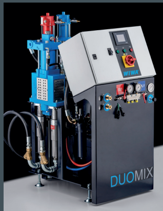
WIWA DUOMIX PU HX, hydraulic plural component spray equipment