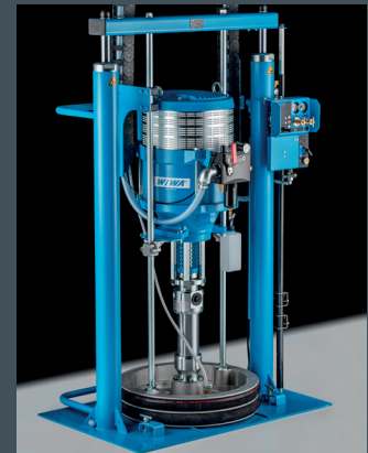
WIWA VULKAN, pneumatic extrusion equipment