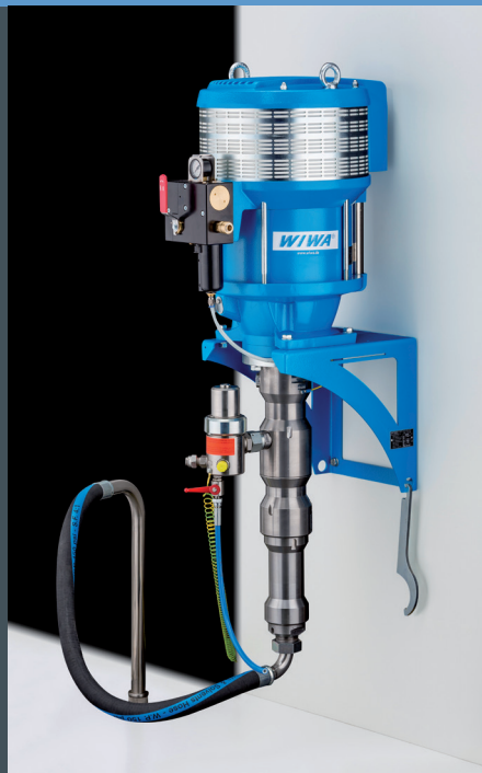
HERKULES GX Wall bracket