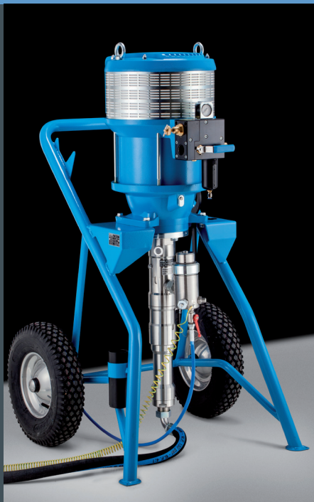
HERKULES GX Cart