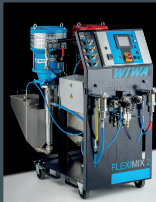
WIWA FLEXIMIX 2, electronic plural component spray equipment

WIWA's extensive product range includes 1K-, 2K- und 3K equipment for processing, spraying and gluing a variety of materials in industrial use. Suitable for large surfaces, high viscosities and coatings for marine and offshore applications. Ideal in corrosion protection, for surface sealing, passive fire protection, in steel and hall construction as well as for all industrial coatings.