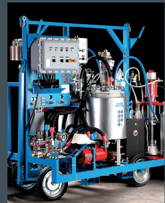
WIWA DUOMIX 333 PFP ATEX, for intumescent fire protection material