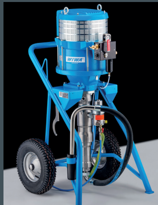
WIWA HERKULES GX 333 GX, single feed (airless) spray equipment