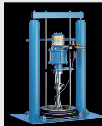
WIWA VULKAN, pneumatic extrusion equipment