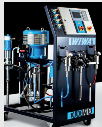
WIWA DUOMIX, pneumatic plural component spray equipment