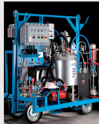
WIWA DUOMIX 333 PFP ATEX, for intumescent fire protection material