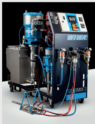
WIWA FLEXIMIX 2 electronic plural component spray equipment

WIWA's extensive product range includes 1K, 2K and 3K application equipment for painting, coating and bonding in the machinery and vehicle manufacturing industries and for large surface, high viscosity and high build coatings used in the marine and offshore industries and steel and masonry construction for corrosion-proofing, surface sealing and passive fire protection.