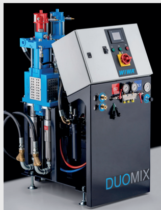
WIWA DUOMIX PU HX, hydraulic plural component spray equipment