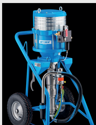
WIWA HERKULES 333 GX, single feed (airless) spray equipment