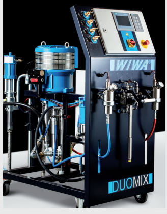
WIWA DUOMIX, pneumatic plural component spray equipment