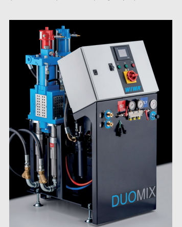
WIWA DUOMIX PU HX, hydraulic plural component spray equipment