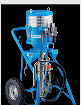
WIWA HERKULES 333 GX, single feed (airless) spray equipment