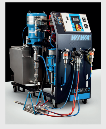
WIWA FLEXIMIX 2 electronic plural component spray equipment

WIWA's extensive product range includes 1K, 2K and 3K application equipment for painting, coating and bonding in the machinery and vehicle manufacturing industries and for large surface, high viscosity and high build coatings used in the marine and offshore industries and steel and masonry construction for corrosion-proofing, surface sealing and passive fire protection.