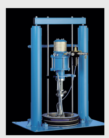
WIWA VULKAN, pneumatic extrusion equipment