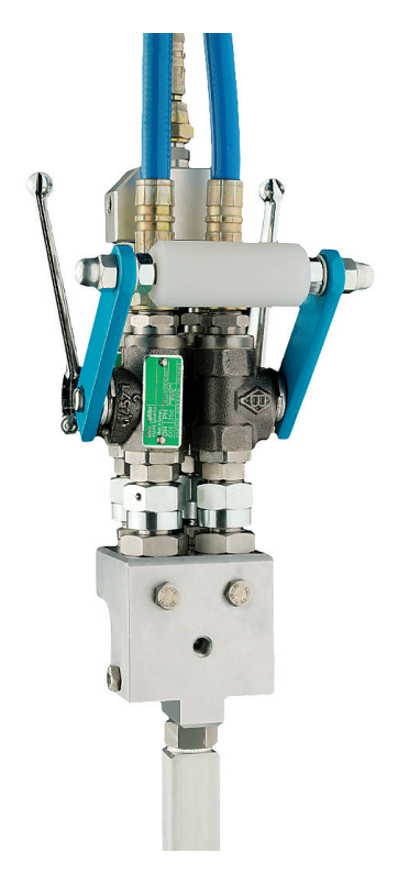
Mixing unit complete with staticmixer and separate flush assembly for the A and B components