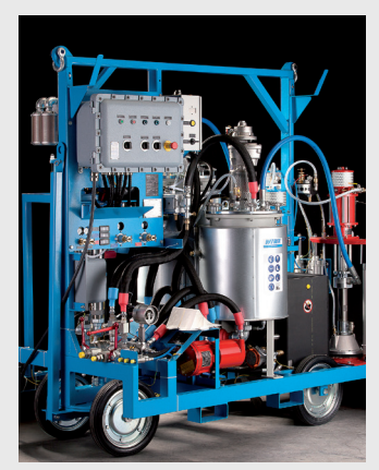
WIWA DUOMIX 333 PFP ATEX, for intumescent fire protection material